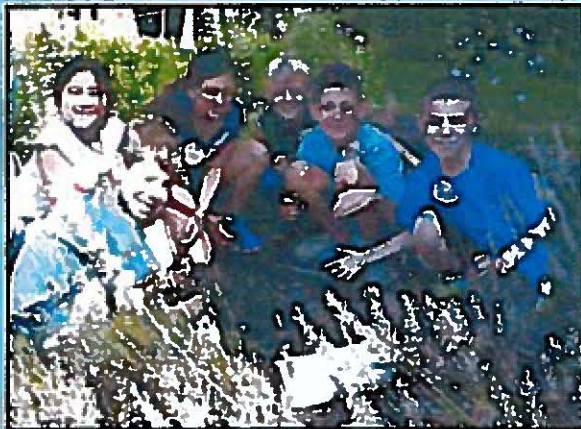
Tending to the kitchen herb garden on the historic Kissam property.