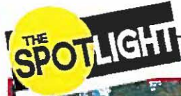
LH Theater Arts Grade 5 Production of Grease (school edition)